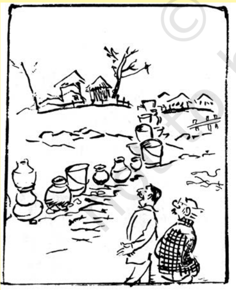
Not bad! One of the taps in the nearby village must be getting water!

What approval or disapproval is being expressed here?