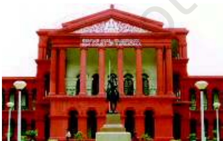
High Court of Karnataka

Let us understand what we mean by the appellate system by tracking a case, State (Delhi Administration) vs Laxman Kumar and Others (1985) , from the lower courts to the Supreme Court.