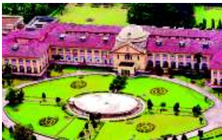
High Court of Patna

Are these different levels of courts connected to each other? Yes, they are. In India, we have an integrated judicial system, meaning that the decisions made by higher courts are binding on the lower courts. Another way to understand this integration is through the appellate system that exists in India. This means that a person can appeal to a higher court if they believe that the judgment passed by the lower court is not just.