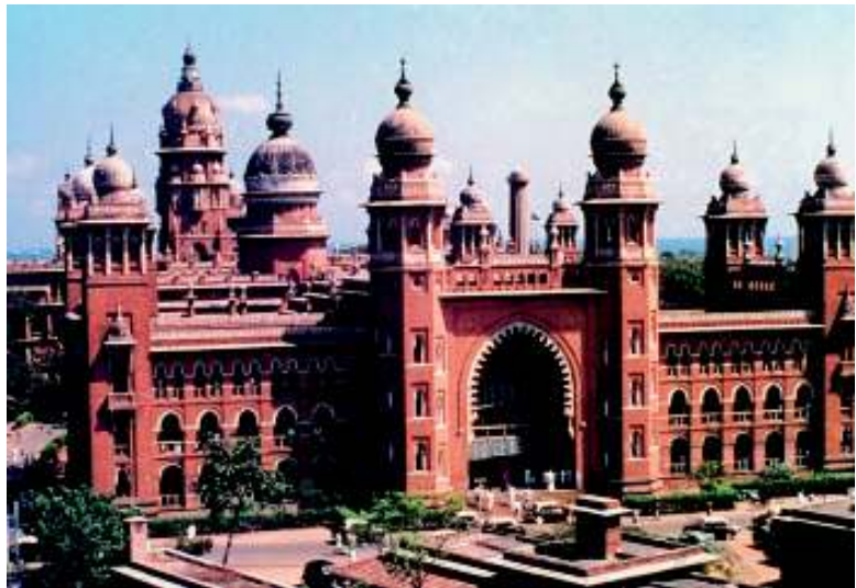
High Court of Madras

High Courts were first established in the three Presidency cities of Calcutta, Bombay and Madras in 1862. The High Court of Delhi came up in 1966. Currently there are 24 High Courts. While many states have their own High Courts, Punjab and Haryana share a common High Court at Chandigarh, and four North Eastern states of Assam, Nagaland, Mizoram and Arunachal Pradesh have a common High Court at Guwahati. Andhra Pradesh and Telangana have a common High Court at Hyderabad. Some High Courts have benches in other parts of the state for greater accessibility.