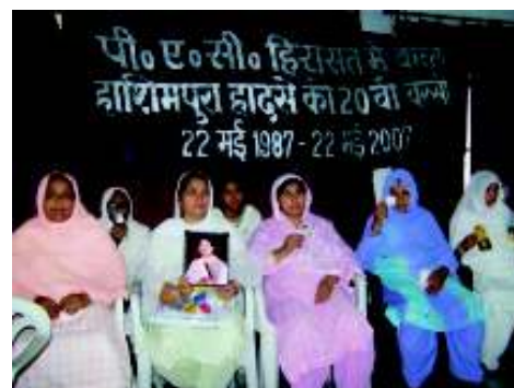
The above photo shows the family members of some of the 43 Muslims of Hashimpura, Meerut, killed on 22 May 1987. These families have been seeking justice for over 20 years. Due to long delay in the commencement of the trial, the Supreme Court in September 2002 transferred the case from the State of Uttar Pradesh to Delhi. The trial is ongoing and 19 Provincial Armed Constabulary (PAC) men are facing criminal prosecution for alleged murder and other offences. By 2007, only three prosecution witnesses had been examined. (photo was taken at Press Club, Lucknow, 24 May 2007)

In a speech made on 26 November 2014, the Chief Justice of India K.G. Balakrishnan noted that, "The Indian judiciary consists of one Supreme Court with 26 judges, 21 High Courts with a sanctioned strength of 725 judges (working strength of 597 as on 1 March 2007) and 14,477 Subordinate courts/judges (working strength of 11,767 as on 31 December 2006)."