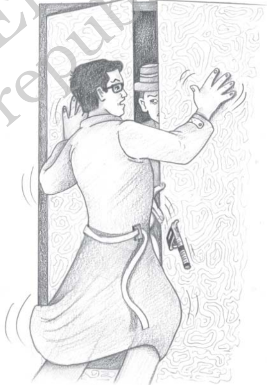
Gerrard gives him a push into the cupboard...

GERRARD : I have got a man posted on the main road. He'll ring up if he sees the