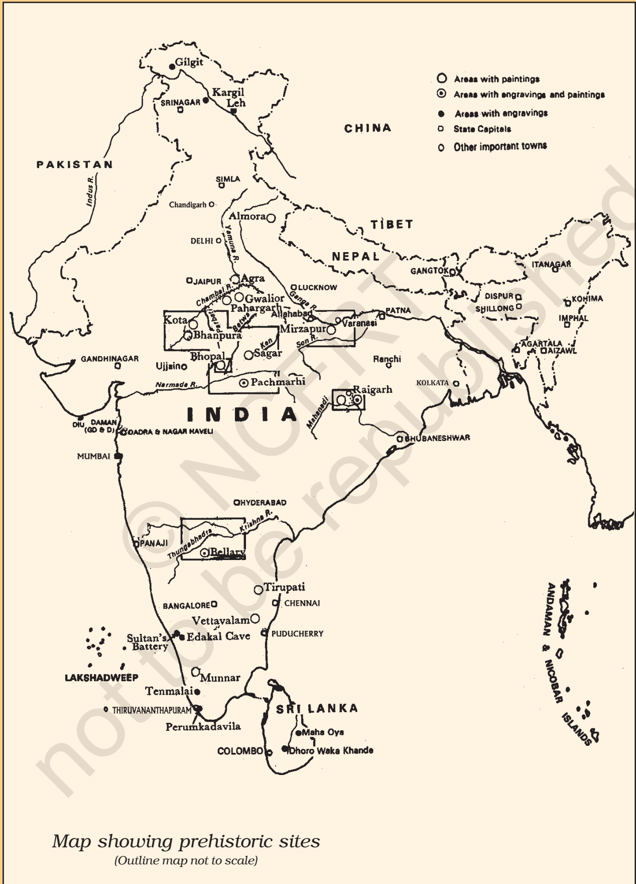
Map showing prehistoric sites (Outline map not to scale)