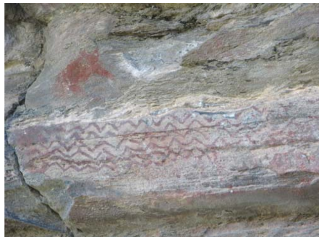
Wavy lines, Lakhudiyar, Uttarakhand