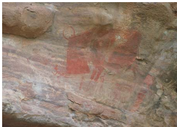
Painting showing a man being hunted by a beast, Bhimbetka

The paintings, though from the remote past, do not lack pictorial quality. Despite various limitations such as acute working conditions, inadequate tools, materials, etc., there is a charm of simple rendering of scenes of the environment in which the artists lived. The men shown in them appear adventurous and rejoicing in their lives. The animals are shown more youthful and majestic than perhaps they actually were. The primitive artists seem to possess an intrinsic passion for storytelling. These pictures depict, in a dramatic way, both men and animals engaged in the struggle for survival. In one of the scenes, a group of people have been shown hunting a bison. In the process, some injured men are depicted lying scattered on the ground. In another scene, an animal is shown in the agony of death and the men are depicted dancing. These kinds