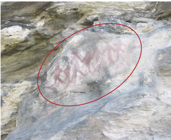
Hand-linked dancing figures, Lakhudiyar, Uttarakhand

Remnants of rock paintings have been found on the walls of the caves situated in several districts of Madhya Pradesh, Uttar Pradesh, Andhra Pradesh, Karnataka and Bihar. Some paintings have been reported from the Kumaon hills in Uttarakhand also. The rock shelters on banks of the River Suyal at Lakhudiyar, about twenty kilometres on the Almora–Barechina road, bear these prehistoric paintings. Lakhudiyar literally means one lakh caves. The paintings here can be divided into three categories: man, animal and geometric patterns in white, black and red ochre. Humans are represented in stick-like forms. A long-snouted animal, a fox and a multiple legged lizard are the main animal motifs. Wavy lines, rectangle-filled geometric designs, and groups of dots can also be seen here. One of the interesting scenes depicted here is of hand-linked dancing human figures. There is some superimposition of paintings. The earliest are in black; over these are red ochre paintings and the last group comprises white paintings. From Kashmir two slabs with engravings have been reported. The granite rocks of Karnataka and Andhra Pradesh provided suitable canvases to the Neolithic man for his paintings. There are several such sites but more famous among them are Kupgallu, Piklihal and Tekkalkota. Three types of paintings have been reported from here—paintings in white, paintings in red ochre over a white background and paintings in red ochre. These