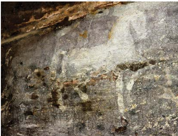
One of the few images showing only one animal, Bhimbetka

of the rock-shelters we find hand prints, fist prints, and dots made by the fingertips.