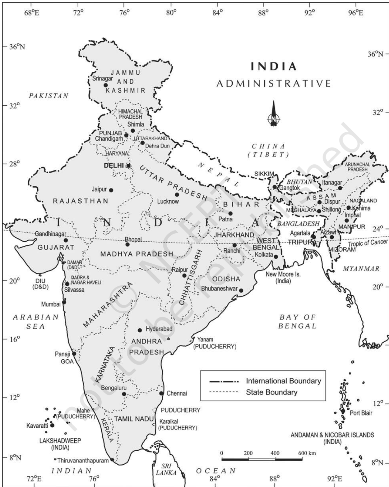
Figure 1.1 : India : Administrative Divisions

Note: Telangana became the 29 th state of India in June 2014.