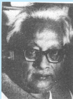
Satyendranath Bose (1894-1974)

Satyendranath Bose, born in Calcutta in 1894, is among the great Indian physicists who made a fundamental contribution to the advance of science in the twentieth century. An outstanding student throughout, Bose started his career in 1916 as a lecturer in physics in Calcutta University; five years later he joined Dacca University. Here in 1924, in a brilliant flash of insight, Bose gave a new derivation of Planck's law, treating radiation as a gas of photons and employing new statistical methods of counting of photon states. He wrote a short paper on the subject and sent it to Einstein who immediately recognised its great significance, translated it in German and forwarded it for publication. Einstein then applied the same method to a