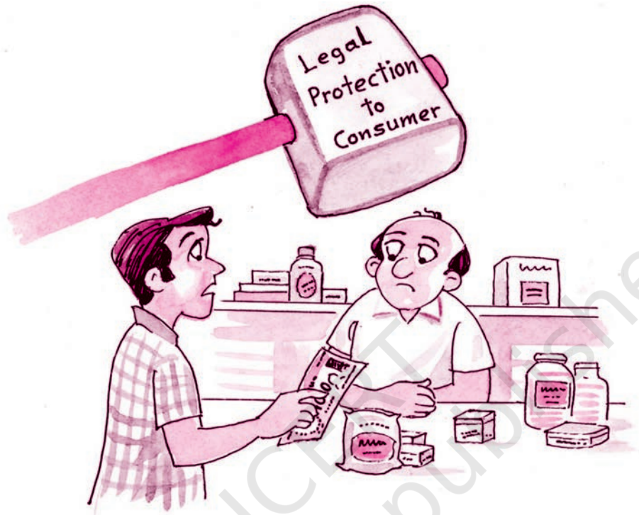
Protection against malpractices and exploitation

against defective goods, deficient services, unfair trade practices, and other forms of their exploitation. The Act provides for the setting up of a three-tier machinery, consisting of District Forums, State Commissions and the National Commission. It also provides for the formation of consumer protection councils in every District and State, and at the apex level.