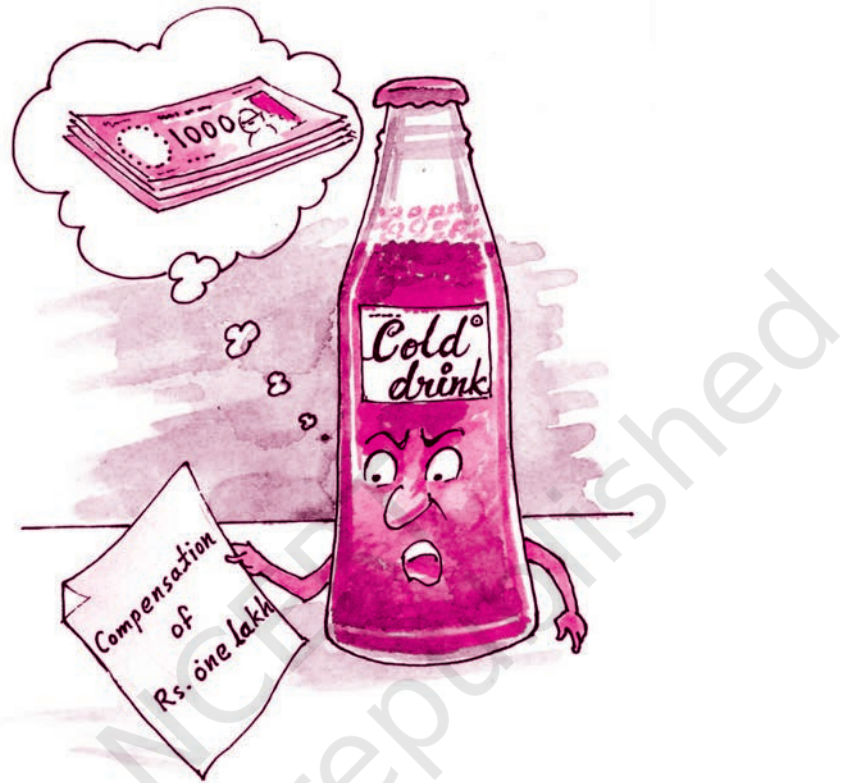
Compensation for impurities in cold drinks

themselves into consumer associations for protection and promotion of their interests. At the same time, consumer protection has a special significance for businesses too.