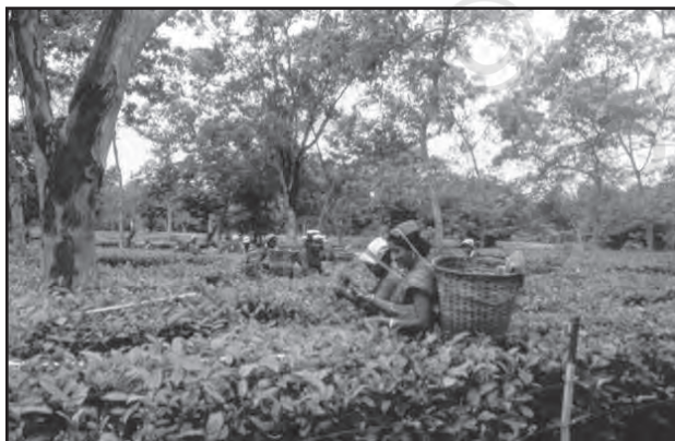
Fig. 5.10 : Tea Farming

Tea is a plantation crop used as beverage. Black tea leaves are fermented whereas green tea leaves are unfermented. Tea leaves have rich content of caffeine and tannin. It is an indigenous crop of hills in northern China. It is grown over undulating topography of hilly areas and well-drained soils in humid and sub-humid tropics and sub-tropics. In India, tea plantation started in 1840s in Brahmaputra valley of Assam which still is a major tea growing area in the country. Later on, its plantation was introduced in the sub-Himalayan region of West Bengal (Darjiling, Jalpaiguri and Cooch Bihar districts). Tea is also cultivated on the lower slopes of Nilgiri and