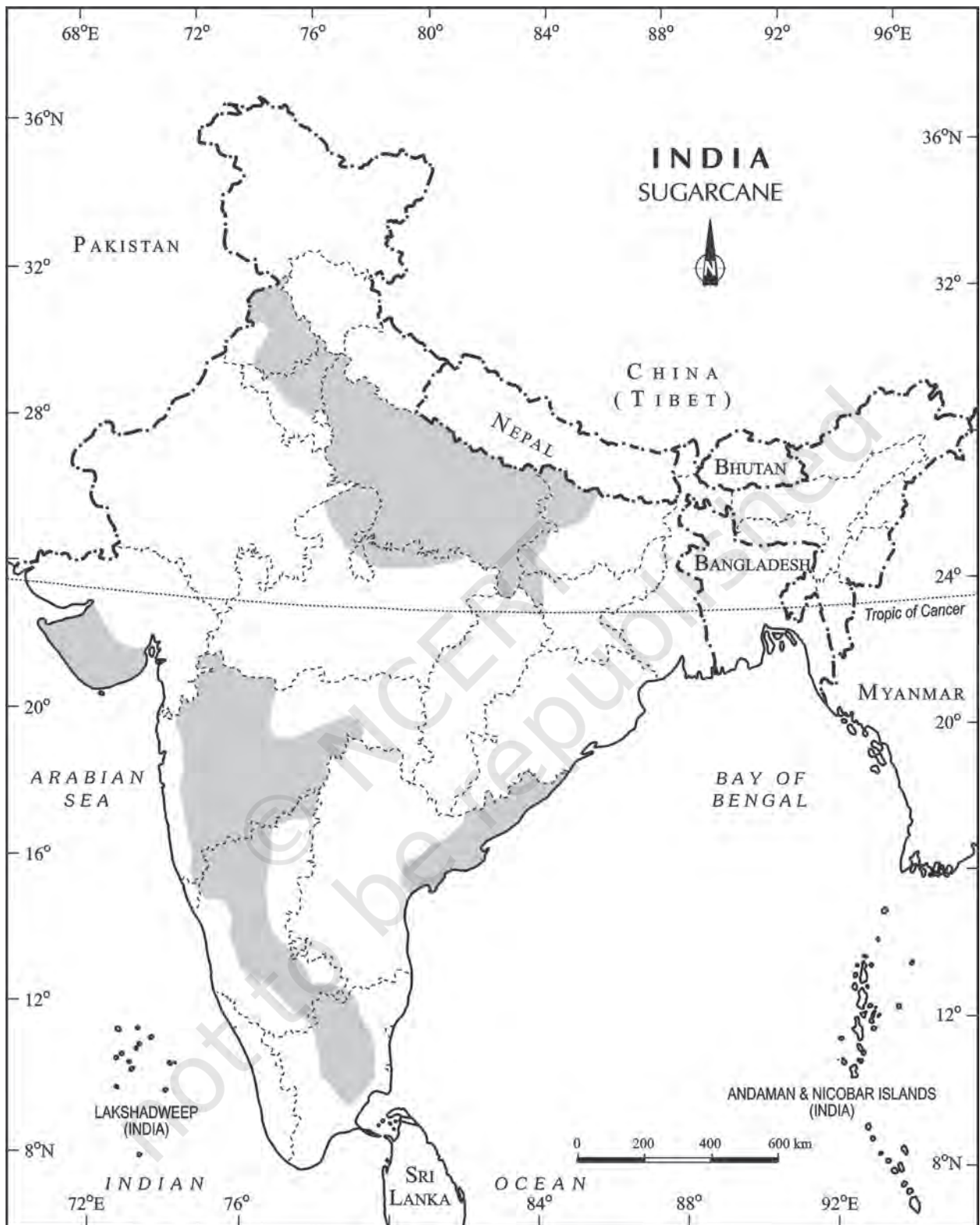
Fig. 5.9 : India - Distribution of Sugarcane