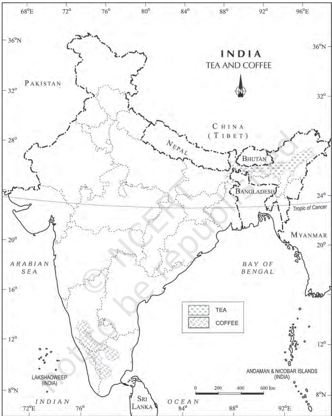
Fig. 5.11 : India - Distribution of Tea and Coffee