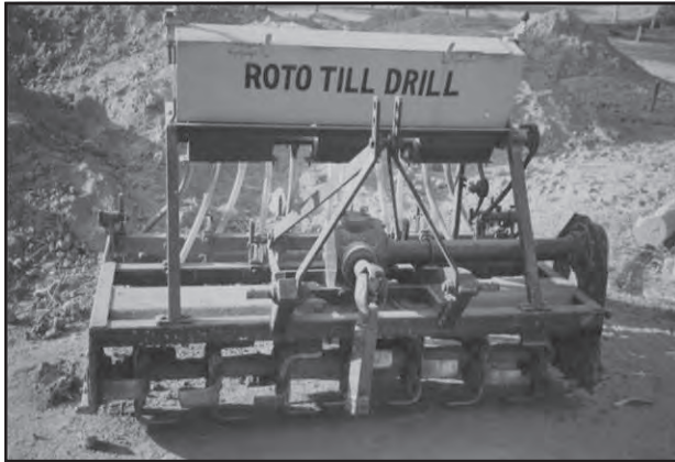
Fig. 5.12 : Roto Till Drill - A modern agricultural equipment

the consumption of chemical fertilizers per unit area is three to four times higher than that of the national average. Since the high yielding varieties are highly susceptible to pests and diseases, the use of pesticides has increased significantly since 1960s.