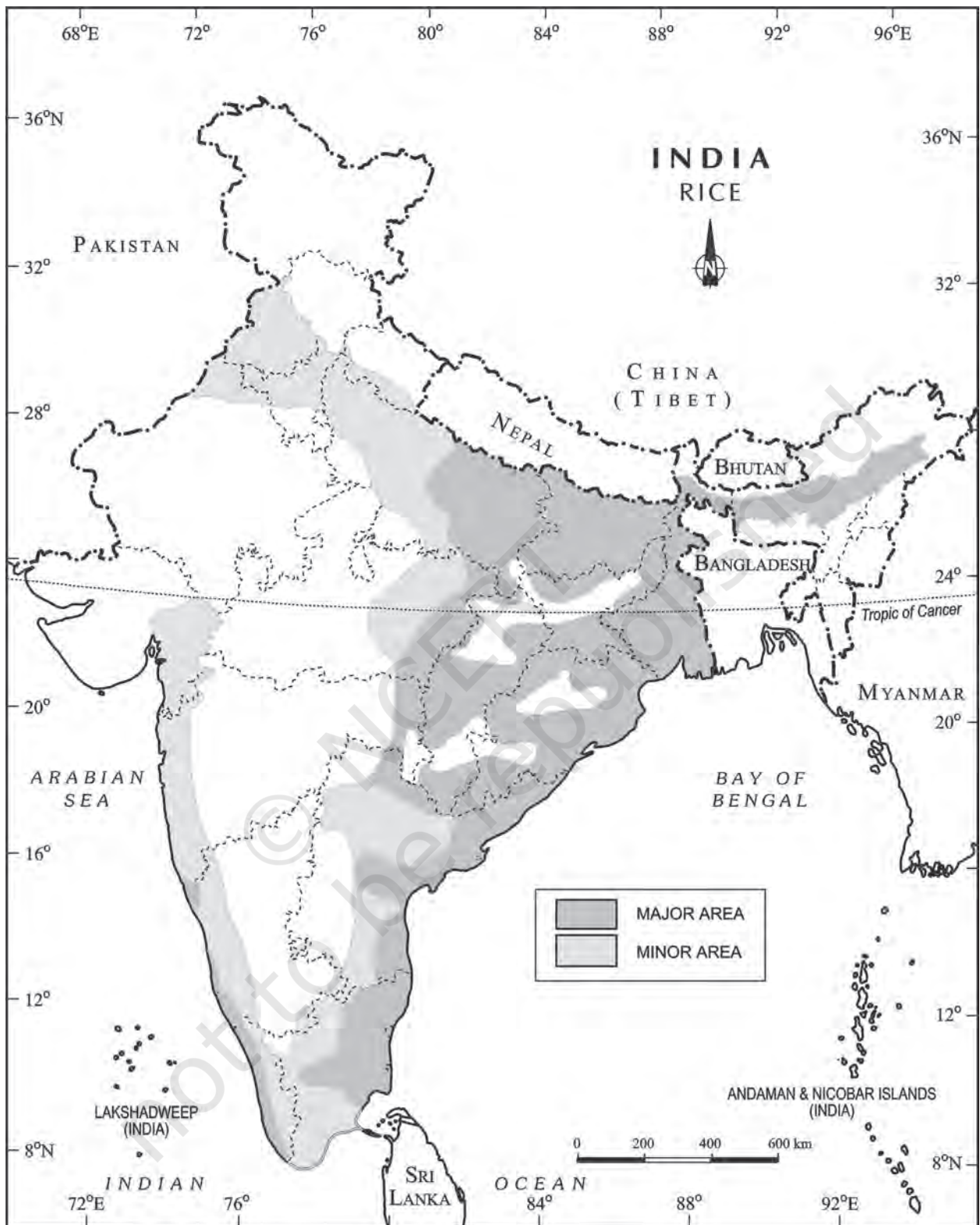
Fig. 5.3 : India - Distribution of Rice