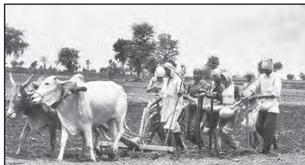
Fig. 5.5 : Farmers sowing soyabean seeds in Amravati, Maharashtra

Soyabean and sunflower are other important oilseeds grown in India. Soyabean is mostly grown in Madhya Pradesh and Maharashtra.