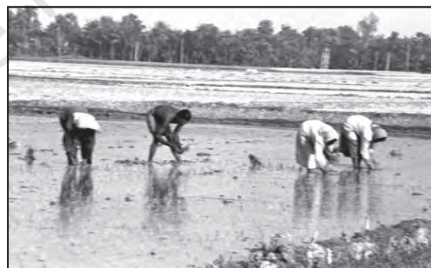
Fig. 5.2 : Rice transplantation in southern parts of India

India contributes 21.6 per cent of rice production in the world and ranked second after China in 2008-09. About one-fourth of the total cropped area in the country is under rice cultivation. West Bengal, Punjab and Uttar Pradesh were the leading rice producing states in the country in 2009-10. The yield level of rice is high in Punjab, Tamil Nadu, Haryana, Andhra Pradesh, Telangana, West Bengal and Kerala. In the first four of these states almost the entire land under rice cultivation is irrigated. Punjab and Haryana are not traditional rice