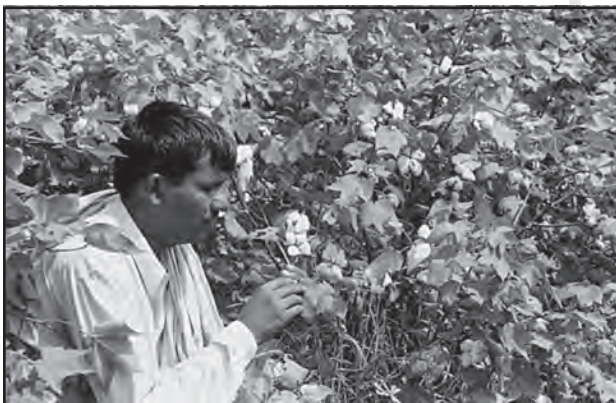
Fig. 5.7 : Cotton Cultivation

Cotton is a tropical crop grown in kharif season in semi-arid areas of the country. India lost a large proportion of cotton growing area to Pakistan during partition. However, its acreage has increased considerably during the last 50 years. India grows both short staple (Indian) cotton as well as long staple (American) cotton called ' nama ' in north-western parts of the country. Cotton requires clear sky during flowering stage.