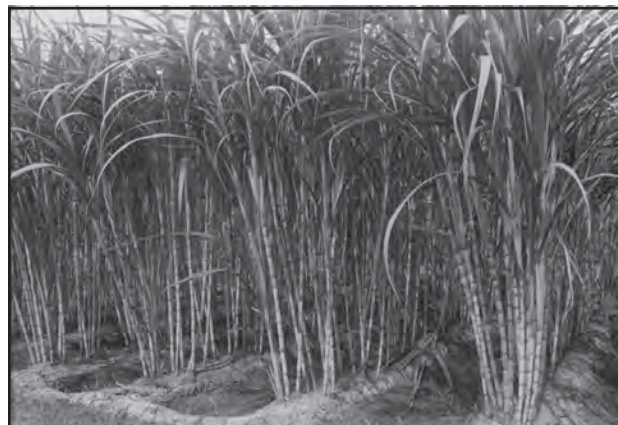
Fig. 5.8 : Sugarcane Cultivation

Sugarcane is a crop of tropical areas. Under rainfed conditions, it is cultivated in sub-humid and humid climates. But it is largely an irrigated crop in India. In Indo-Gangetic plain, its cultivation is largely concentrated in Uttar Pradesh. Sugarcane growing area in western India is spread over Maharashtra and Gujarat.