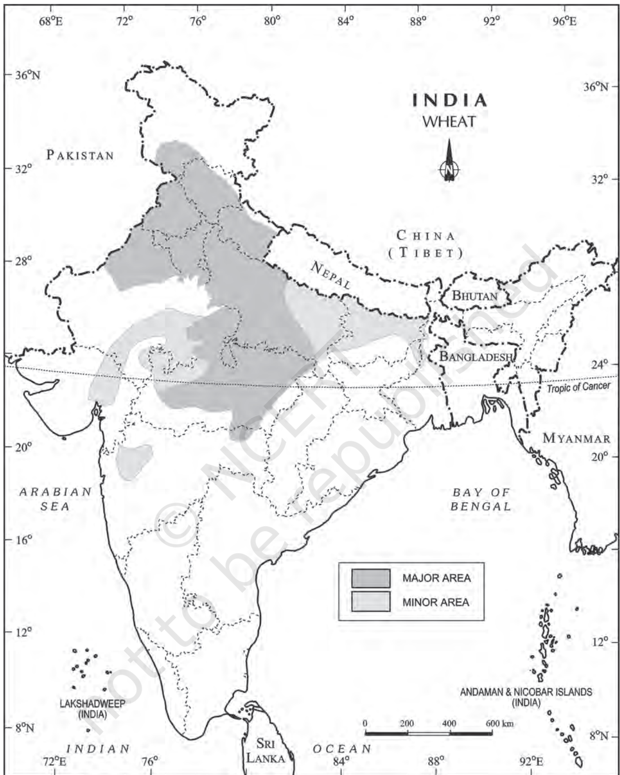
Fig. 5.4 : India - Distribution of Wheat