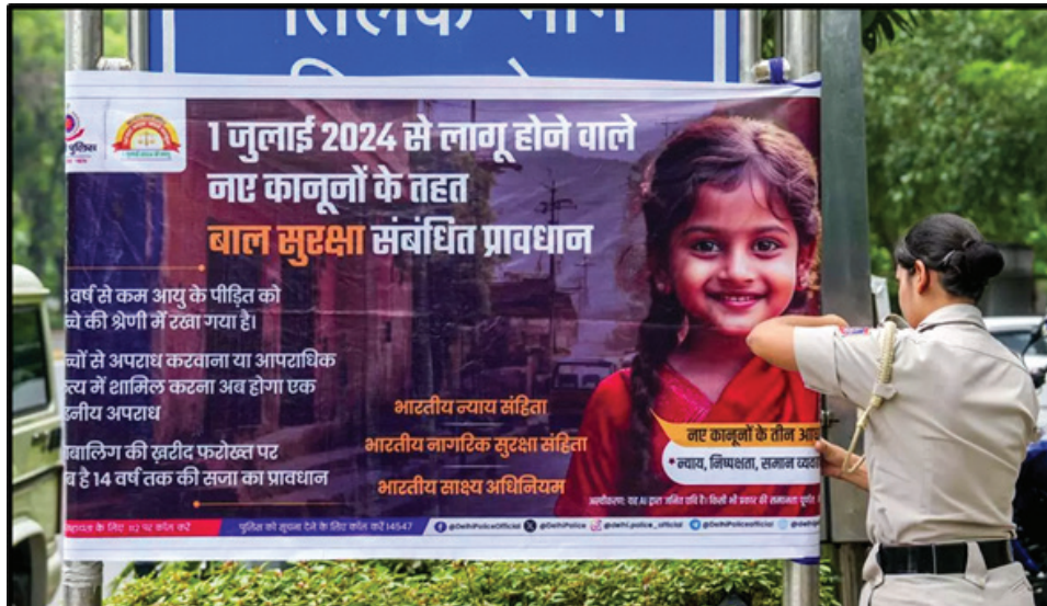
Source: Delhi Police display awareness poster for new criminal laws on 1st July 2024

Before we explain the Bharatiya Sakshya Adhinyam 2023, you should understand some of the important definitions that will be frequently used. They are mentioned in the box given below.