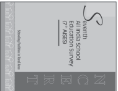
Seventh All India School Education Survey (7th AISES) Schooling Facilities in Rural Area Rs 165.00/238 pp

For further enquiries, please visit www.ncert.nic.in or contact the Business Managers at the addresses of the regional centres given on the copyright page.