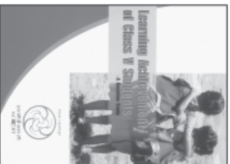
Learning Achievement of Class V Students – A Baseline Study Rs. 1165.00/795pp