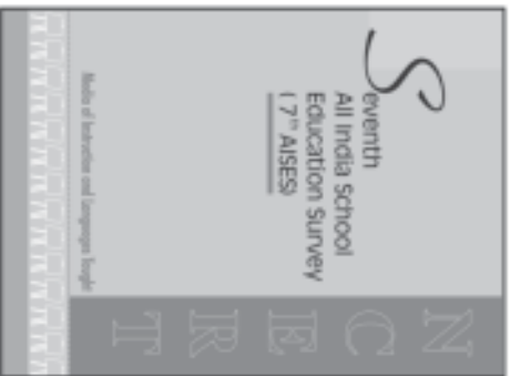
Seventh All India School Education Survey (7th AISES) Media of Instruction and Languages Taught Rs 135.00/200 pp