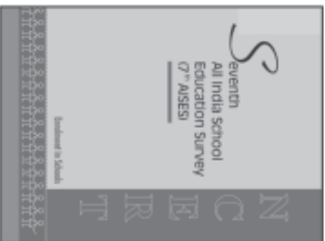
Seventh All India School Education Survey (7th AISES) Enrolment in Schools Rs 250.00/386 pp