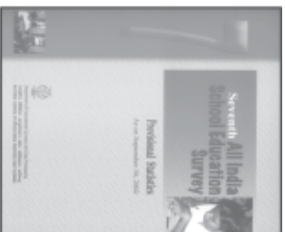
Seventh All India School Education Survey Provisional Statistics As on September 30, 2002 Rs. 195.00/210pp