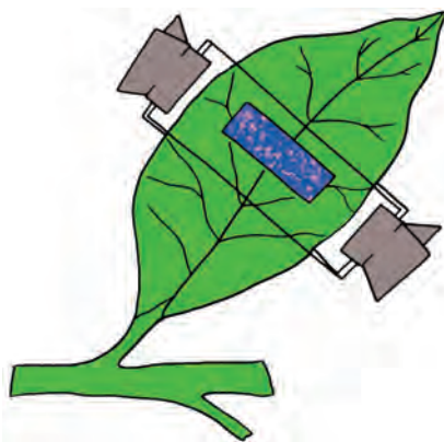
Fig. 19.1 Experimental leaf with cobalt chloride paper