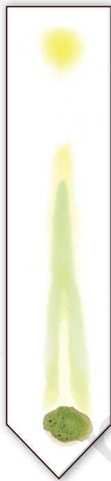
Fig. 23.3 A chromatogram of chlorophyll