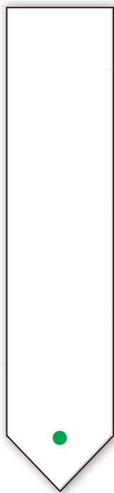
Fig. 23.1 Loading of pigment extract