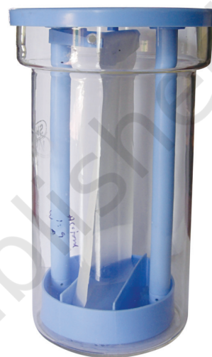
Fig. 23.2 Experimental setup of the chromatography