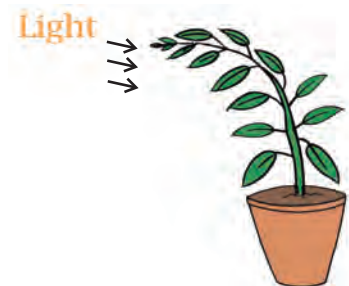
Fig. 25.2 A potted plant showing phototropism