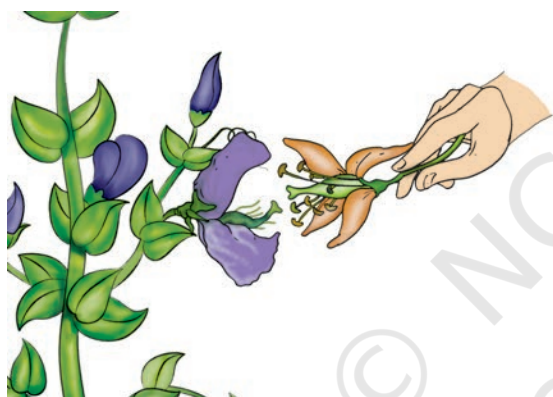
Fig. 12.3 Showing cross pollination on an emasculated flower

(ii) Cover the emasculated flower with a plastic bag to protect it from undesired pollen (Bagging) (Fig. 12.2). The bag should be held securely in place with a paper clip/string/thread. Select the size of bag in accordance with the flower size. Bags must be transparent with minute pores.