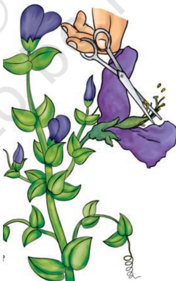
Fig. 12.1 Showing process of Emasculation