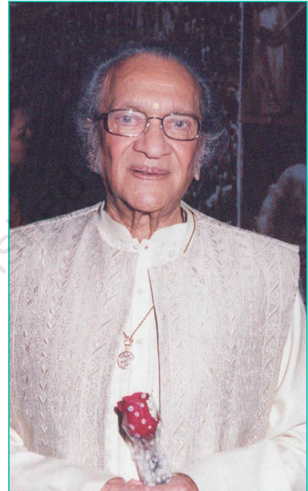
Pandit Ravishankar (Bharat Ratna Awardee)

Instruments create a rich musical experience. Instruments can be classified based on their utility and the material with which they are created. Listen to the songs that you enjoy. Identify the instruments used and classify them in different categories.