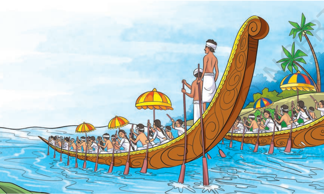
Kerala snake boat race

Learn a Vanchipattu . Vanchipattu is associated with the traditional boat races, particularly the famous snake boat races that take place in the backwaters of Kerala. These boat races are an integral part of the cultural festivities in the state. They are accompanied by lively and rhythmic boat songs.