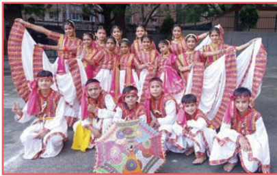
Garba dance from Gujarat