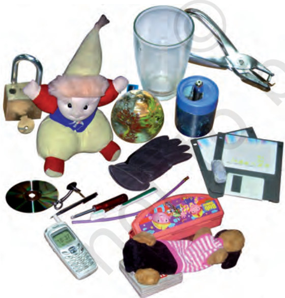
Fig. 4.1 Objects around us

Let us collect as many objects as possible, from around us. Each of us could get some everyday objects from home and we could also collect some objects from the classroom or from outside the school. What will we have in our collection? Chalk, pencil, notebook, rubber, duster, a hammer, nail, soap, spoke of a wheel, bat,