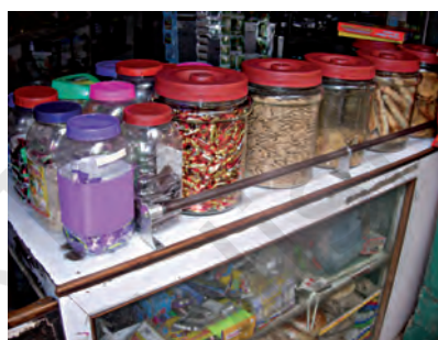
Fig. 4.8 Transparent bottles in a shop

hide behind a glass window? Obviously not, as your friends can see through that and spot you. Can you see through all the materials? Those substances or materials, through which things can be seen, are called transparent (Fig. 4.7). Glass, water, air and some plastics are examples of transparent materials. Shopkeepers usually prefer to keep biscuits, sweets and other eatables in transparent containers of glass or