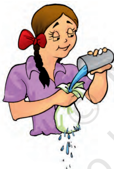
Fig. 4.2 Using a cloth tumbler

Have you ever wondered why a tumbler is not made with a piece of cloth? Recall our experiments with pieces of cloth in Chapter 3 and also keep in mind that we generally use a tumbler to keep a liquid. Therefore, would it not be silly, if we were to make a tumbler out of cloth (Fig 4.2)! What we need for a tumbler is glass, plastics, metal or other such material that will hold water. Similarly, it would not be wise to use paper-like materials for cooking vessels.