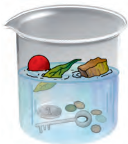
Figure 4.6 Some objects float in water while others sink in it

drops of honey that you let fall into a glass of water. What happens to all of these?