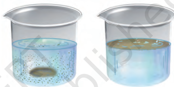
Fig. 4.4 What disappears, what doesn't?

beakers. Fill each one of them about two-thirds with water. Add a small amount (spoonful) of sugar to the first glass, salt to the second and similarly, add small amounts of the other substances into the other glasses. Stir the contents of each of them with a spoon. Wait for a few minutes. Observe what happens to the substances added to water (Fig. 4.4). Note your observations as shown in Table 4.3.