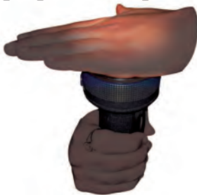
Fig. 4.9 Does torch light pass through your palm?

We can therefore group materials as opaque, transparent and translucent.