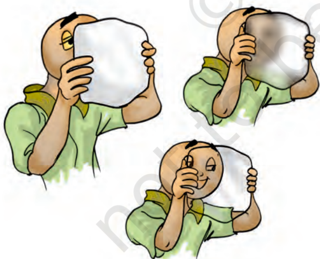
Fig. 4.7 Looking through opaque, transparent or translucent material

You might have played the game of hide and seek. Think of some places where you would like to hide so that you are not seen by others. Why did you choose those places? Would you have tried to