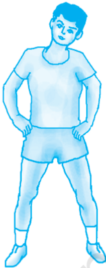
1. Head tilt (side to side)

Warming Up: Muscle stiffness is thought to be directly related to muscle injury and therefore, the warming up should be aimed at reducing muscle stiffness.