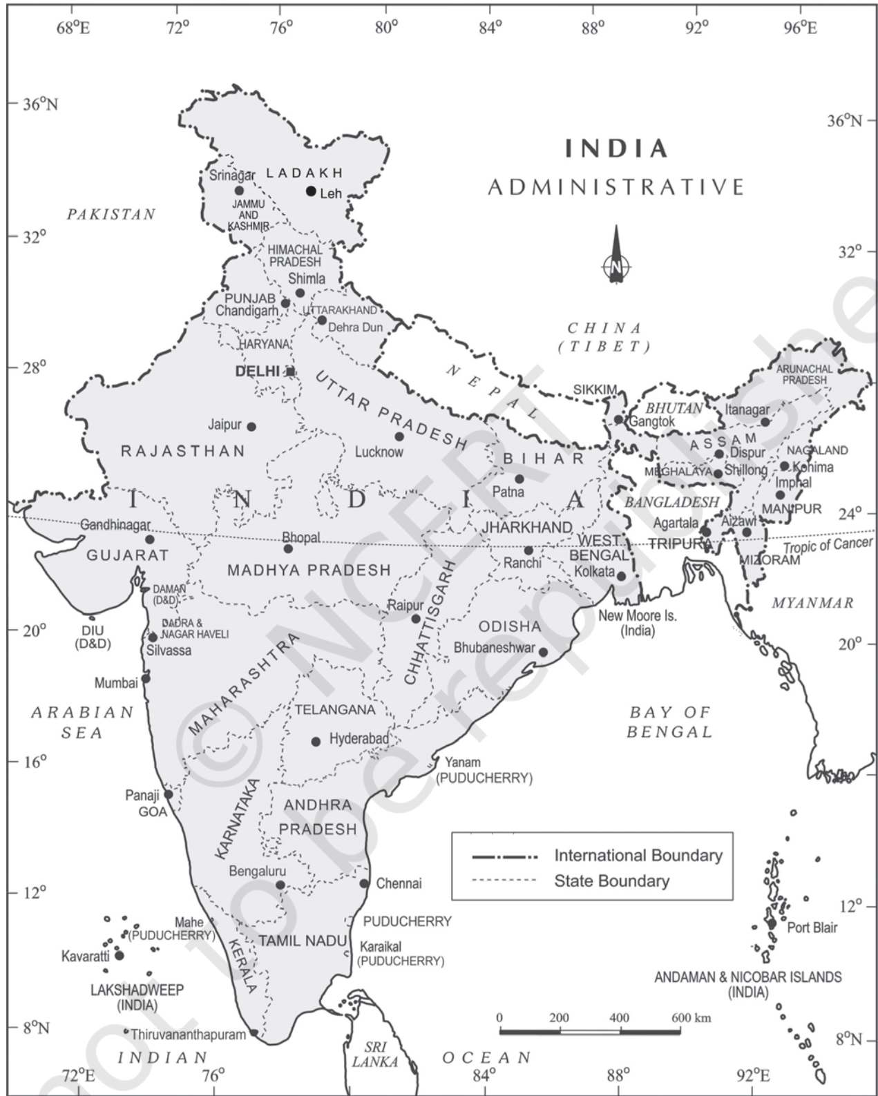
Figure 1.1 : India : Administrative Divisions