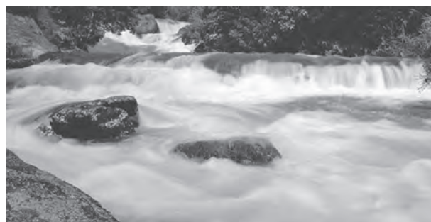
Figure 3.3 : Rapids

The Himalayan drainage system has evolved through a long geological history. It mainly includes the Ganga, the Indus and the Brahmaputra river basins. Since these are fed both by melting of snow and precipitation, rivers of this system are perennial. These rivers pass through the giant gorges carved out by the erosional activity carried on simultaneously with the uplift of the Himalayas. Besides deep gorges, these rivers also form V-shaped valleys, rapids and waterfalls in their mountainous