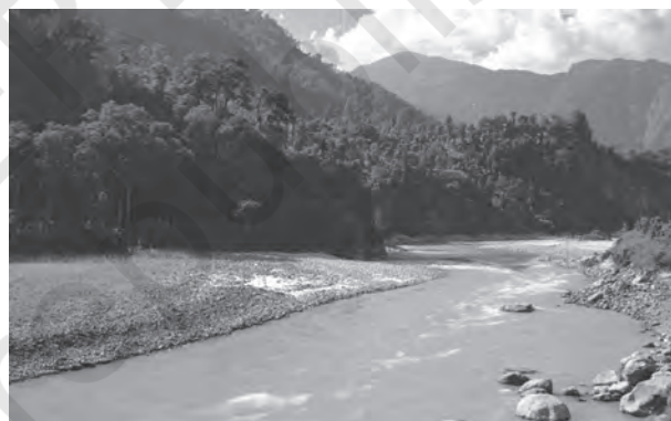
Figure 3.1 : A River in the Mountainous Region

2006) in this class. Can you, then, explain the reason for water flowing from one direction to the other? Why do the rivers originating from the Himalayas in the northern India and the Western Ghat in the southern India flow towards the east and discharge their waters in the Bay of Bengal?