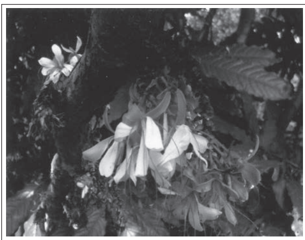
Figure 14.3 : Humboldtia decurrens Bedd — highly rare endemic tree of Southern Western Ghats (India)

There is an urgent need to educate people to adopt environment-friendly practices and reorient their activities in such a way that our development is harmonious with other life forms and is sustainable. There is an increasing consciousness of the fact that such conservation with sustainable use is possible only with the involvement and cooperation of local communities and individuals. For this, the development of institutional structures at local levels is necessary. The critical problem is not merely the conservation of species nor the habitat but the continuation of process of conservation.