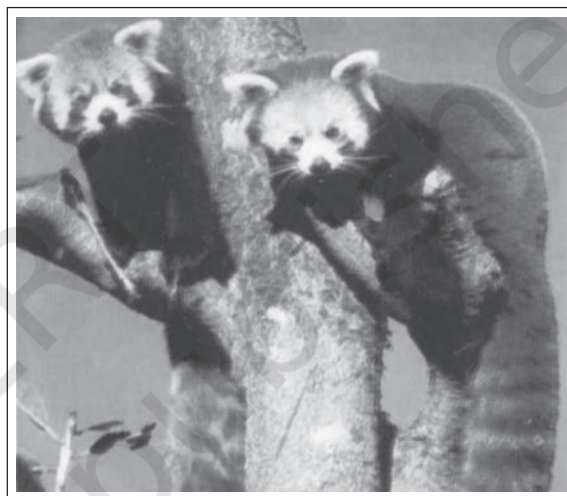
Figure 14.2 : Red Panda — an endangered species

It includes those species which are in danger of extinction. The IUCN publishes information about endangered species world-wide as the Red List of threatened species.