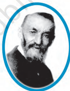
G. Peano (1858-1932)

In contrast to deduction, inductive reasoning depends on working with each case, and developing a conjecture by observing incidences till we have observed each and every case. It is frequently used in mathematics and is a key aspect of scientific reasoning, where collecting and analysing data is the norm. Thus, in simple language, we can say the word induction means the generalisation from particular cases or facts.