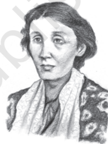
Virginia Woolf 1882-1941

This essay records fleeting impressions and delicate shades of mental experience.